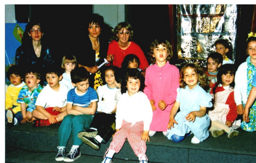
1) From left: Deputy Mayor of Vercelli; Piedmont Pres. Association Korczak; Education officer; Consul General Poland; Consul General Israel; Education officer Vercelli Province of Vercelli. 2) Consul General Poland delivers a portrait of J. Korczak; 3) Children on stage conclude their show with a song.

The Italian political, cultural and religious world witnessed the importance of the event, sending numerous messages; among those attending were: