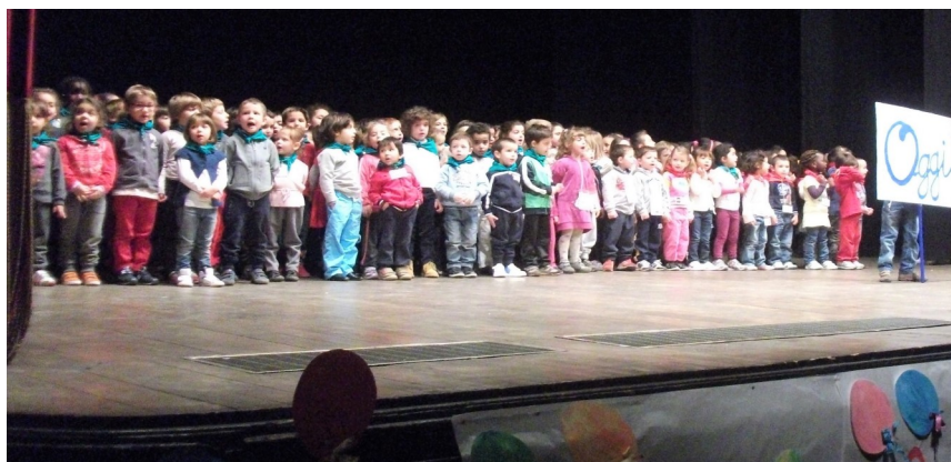
Vercelli Civic Theatre: An example of the many celebrations carried out by the Association to celebrate the "International Day of Children's Rights". On stage: some children of the Vercelli infant schools protagonist of their festival.