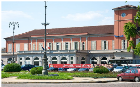
1) Vercelli Railway Station.