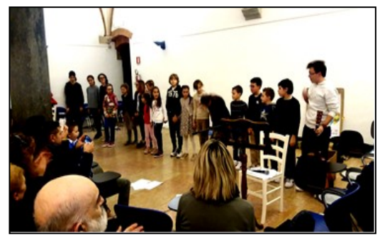
1- 2) President of Piedmont Association with the Councillor for Education in Vercelli and the teacher of music and drama; 3- 4) Children protagonist of the show.