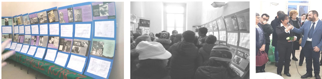
Exhibition: 1) Panels related to the "Life of Janusz Korczak; 2) Visiting students; 3) President Piedmont Association presents J. Korczak.

B) "ART ... IS LIFE" : in February 2017, the Association participated with its own exhibition to an abstract-informal contemporary art exhibition in Vercelli, together with other associations and local authorities. This activity aimed to diffuse the thoughts of the great educator and the Rights of Children with the slogan: "CHILDREN ARE PEOPLE ALREADY TODAY... NOT TOMORROW" , particularly among the students.