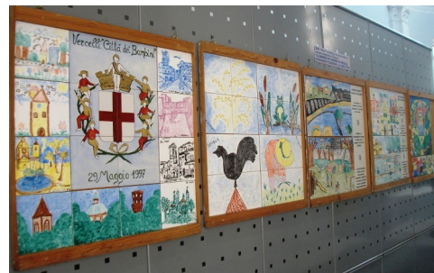
2) Polychrome tiles painted by the children.