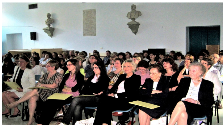
Conference: presentation to the public of the work realized with the participation of the professors of the Catholic University of Milan.

Organization of a creative one-year workshop in a primary school of the province of Vercelli, with the collaboration of some professors of the Catholic University of Milan. The project happily ended with a conference entitled: "The Other Face of Intelligence" in which it was presented the work done and delivered a "hypertext" on DVD to a hundred participants, including teachers, school managers and psychologists.