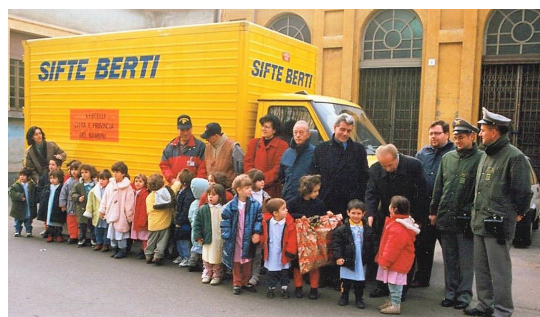
1) Students of Vercelli deliver their gifts to the children affected by calamity; 2) A group of children greet the volunteers who go to deliver their gifts to the unfortunate children.