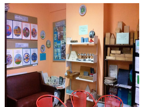
1) Headquarters of the Association: "Centre of culture and documentation"; 2) Inside: 1st hall with documentation of the Association and historical provincial school library; 3) 2nd room including original Montessori and Froebel material.