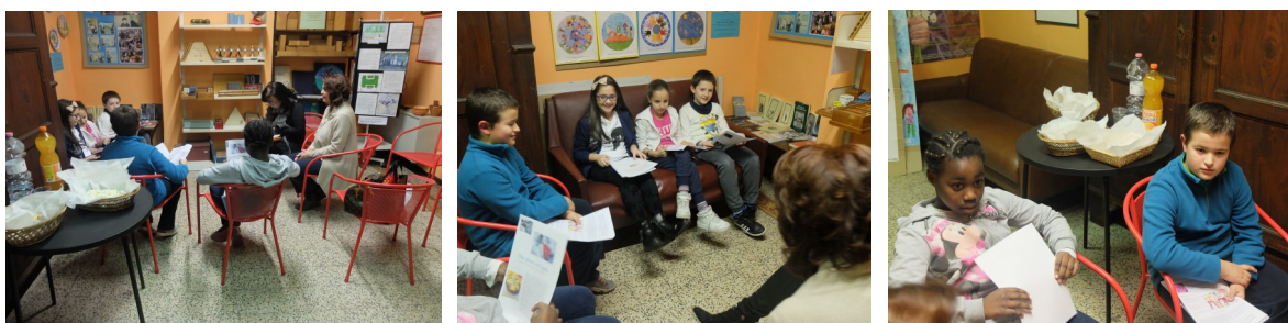
1) Headquarters of the "Culture and Documentation Centre": children at work for the editorial of their newspaper "La voce dei bambini" .